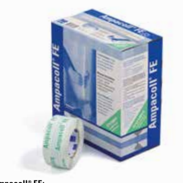
Ampacoll® FE: Window installation tape for wooden constructions